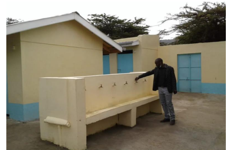
Naikarra Primary School Toilet Block Handwashing Station Kenya