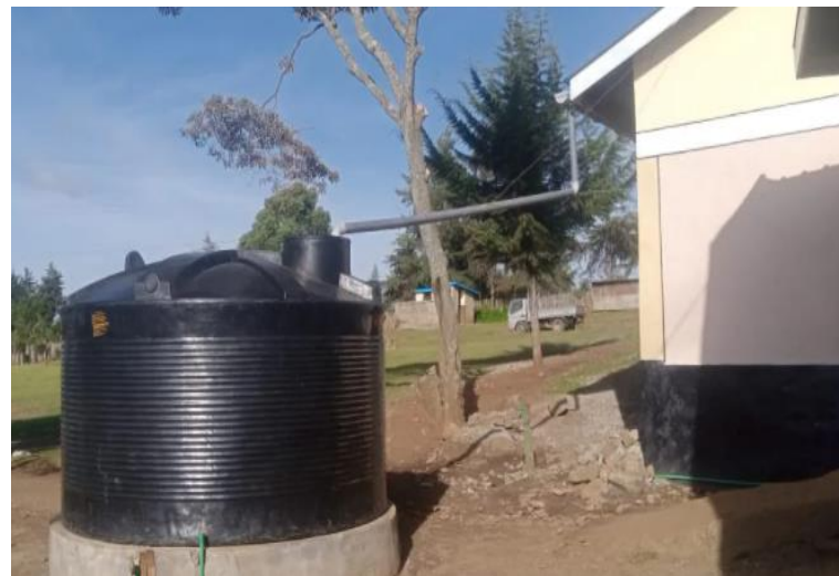
Jogoo Primary School Water Catchment System Tanks Kenya