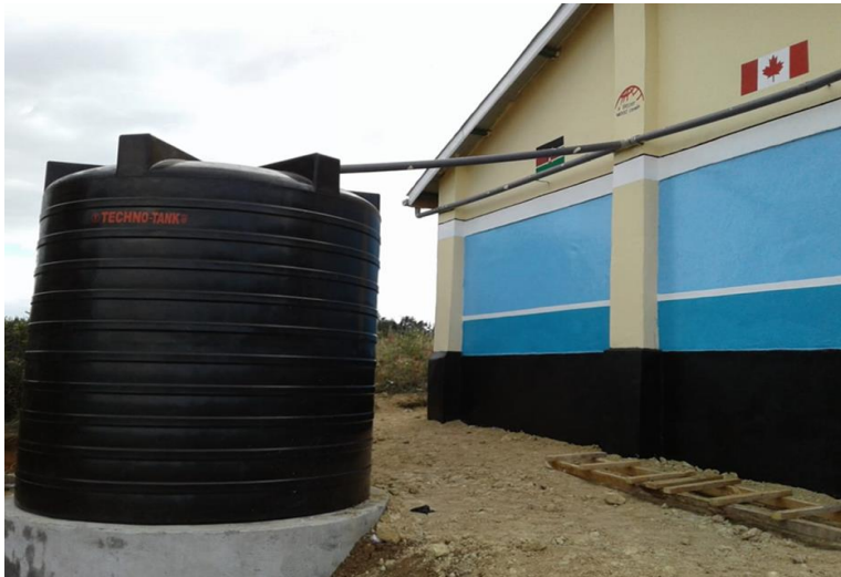
Huhoini Primary School Water Catchment System Tank Kenya