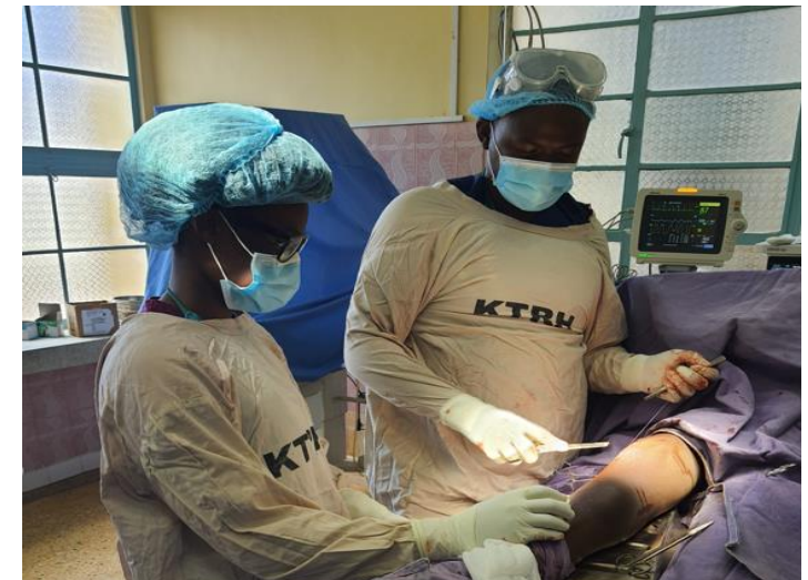
Kendu Adventist Hospital Surgery Kenya