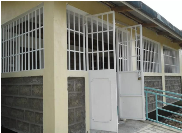
Naikarra Health Clinic Rehab room renovation Kenya