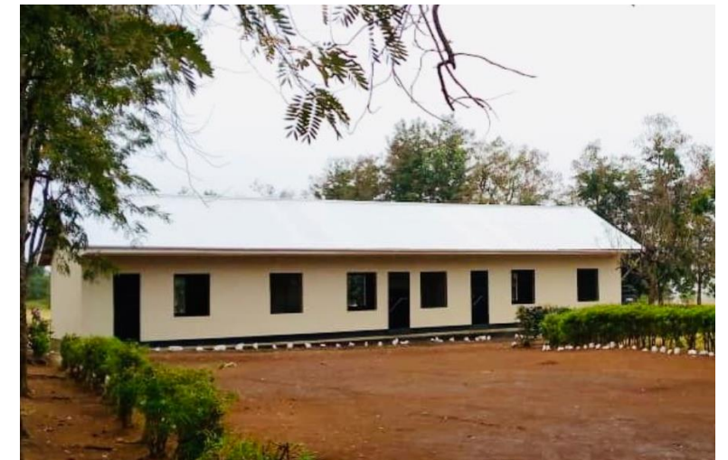
Kasiga Primary School 2 Classrooms Tanzania