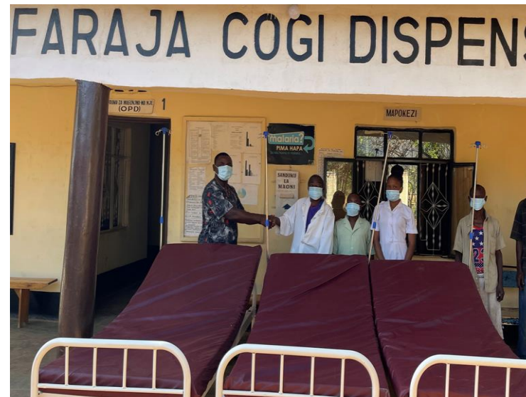
Faraja Cogi Dispensary 7 new beds provided Tanzania