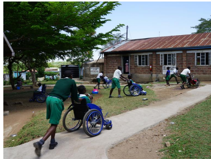
Nyaburi Integrated School Rehab Services Kenya