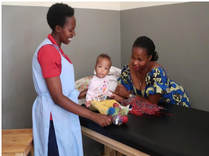
Ubumbwe Community Center Rehab Services Rwanda