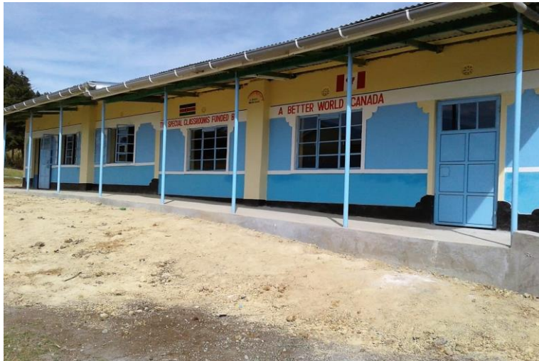
Huhoini Primary School 2 Special Needs Classrooms Kenya