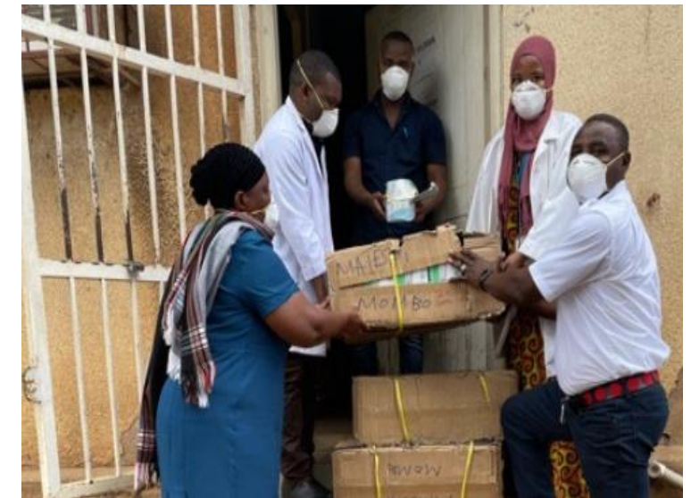
Mombo Hospital Gloves and mask supplies provided Tanzania