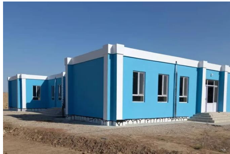
Baba Ali School 5 Classrooms Afghanistan